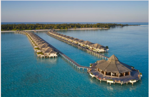
VILLA PARK SUN ISLAND