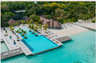
VILLA NAUTICA PARADISE ISLAND