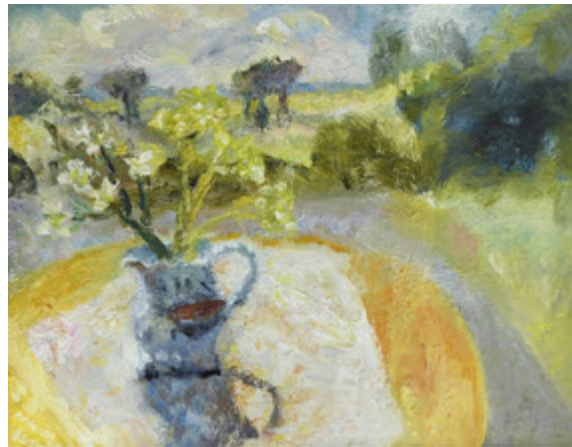
Alice Mumford RWA, High Summer, Polgrean

Selection of Modern and Contemporary British Art