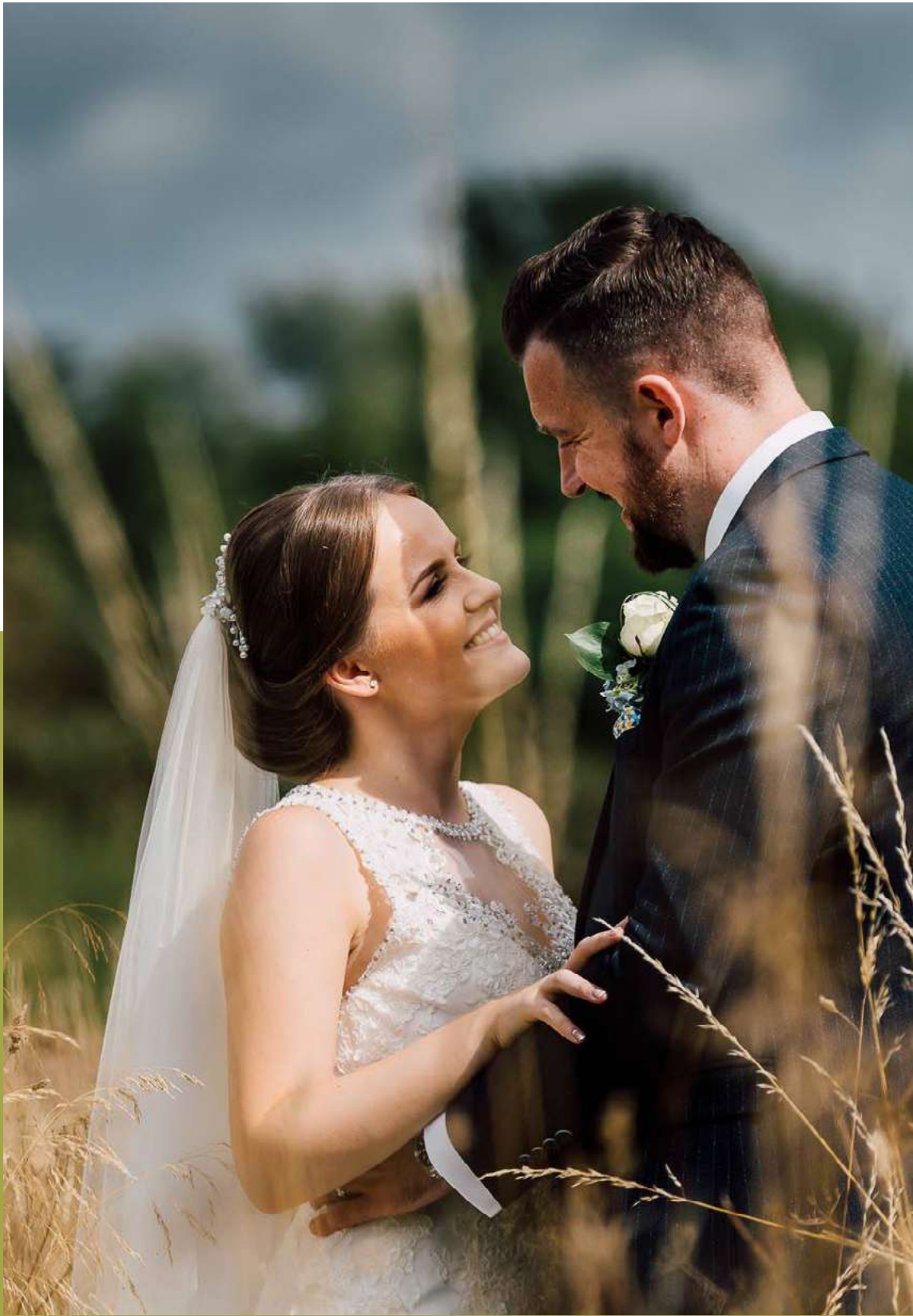
Sporting Lodge Inns