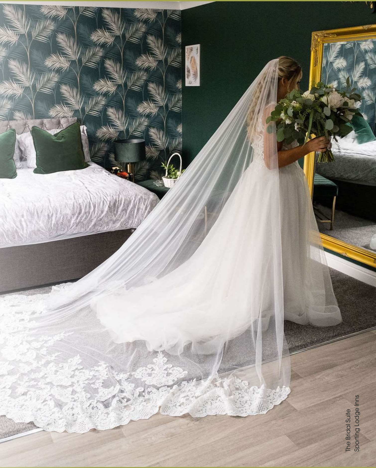
The Bridal Suite Sporting Lodge Inns