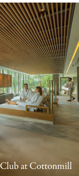
Club at Cottonmill