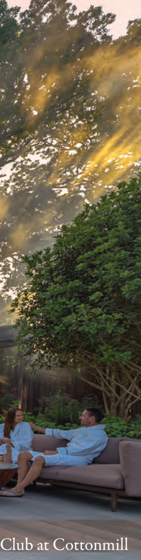
Club at Cottonmill