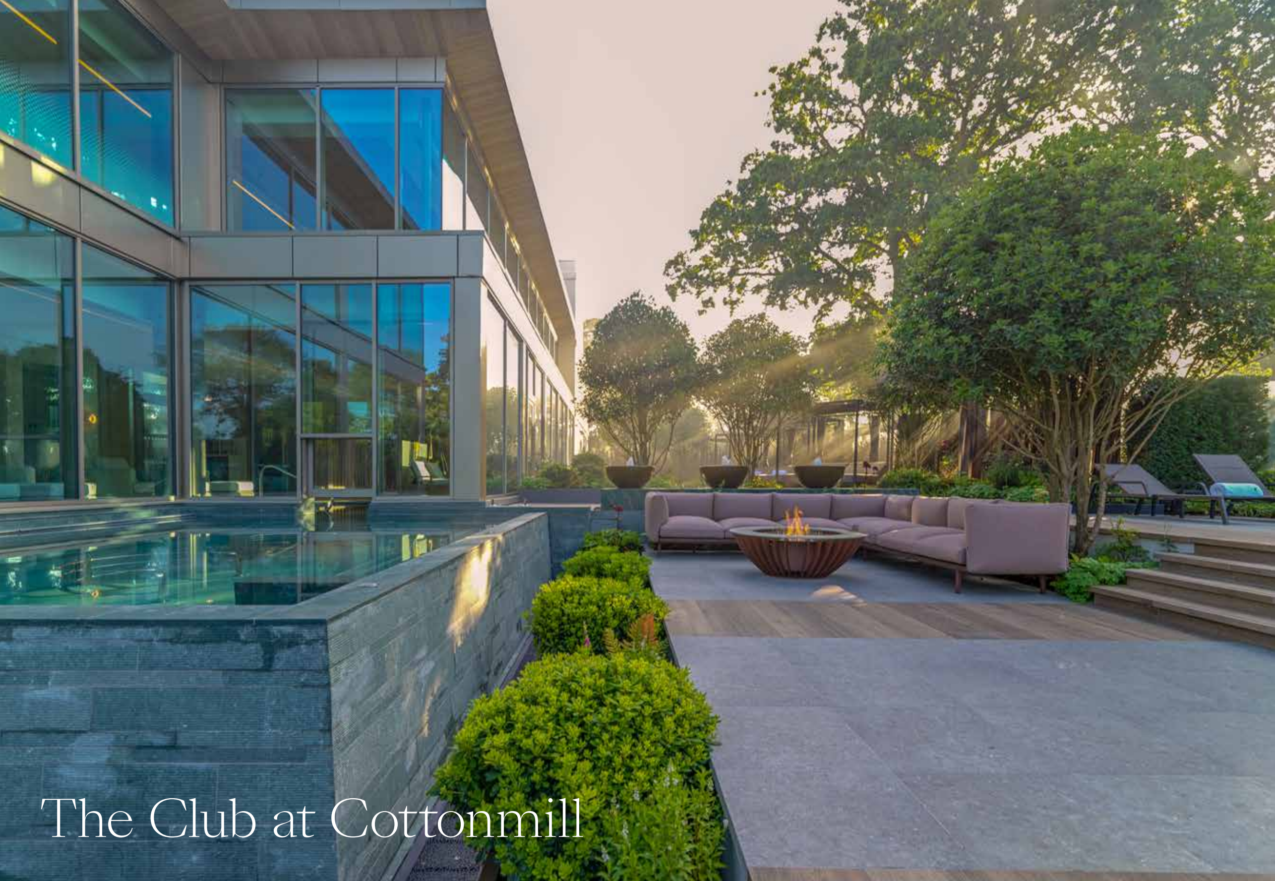
The Club at Cottonmill