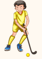
- lacrosse - boxing - polo - kayaking - windsurfing - taekwondo - hockey - hocky - polo - kayaking - windsurfing - lacrosse - boxing