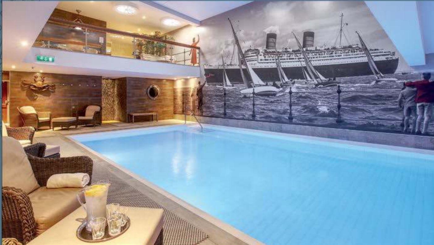
The Voyage Spa