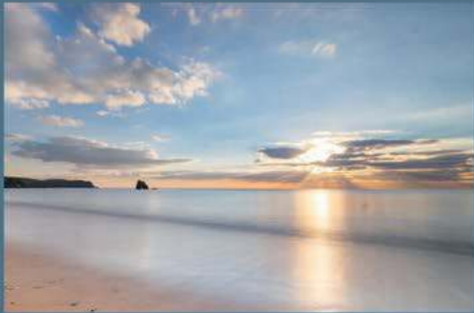
THURLESTONE HOTEL AND SPA