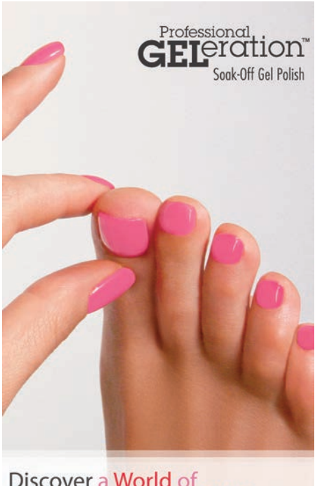
Discover a World of EVERLASTING COLOUR.

Existing Gel removal (prior to Geleration manicure or pedicure). If a client has an existing gel to be removed, we would advise approximately 20 minutes on the above treatment times with an additional charge of £16.