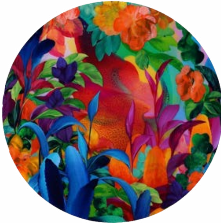
Orlanda Broom Curious Blue , 2022 Acrylic and resin on canvas 60 cm x 60 cm x 5 cm £4,000