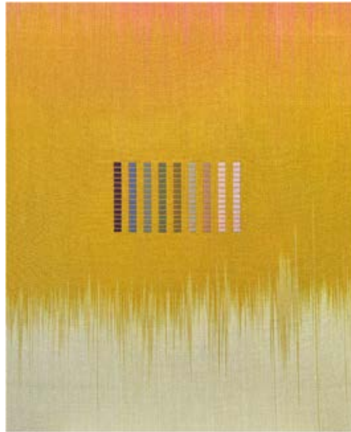
Ptolemy Mann The Golden Hour (Yellow Ombre with Blue Grid) , 2022 Hand dyed and woven viscose 79 cm x 64 cm (framed) POA

These works are available for purchase Please contact @kate@artscopeintl.com regarding sales enquiries