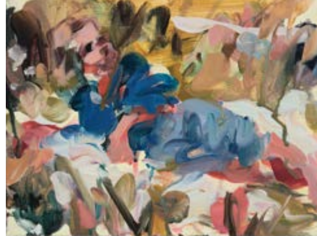
Laura Lancaster Untitled , 2021 Acrylic on linen 30 cm x 40 cm POA

These works are available for purchase Please contact @kate@artscopeintl.com regarding sales enquiries