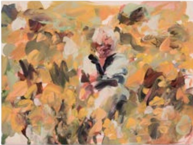
Laura Lancaster Untitled , 2021 Acrylic on canvas 30 cm x 40 cm POA