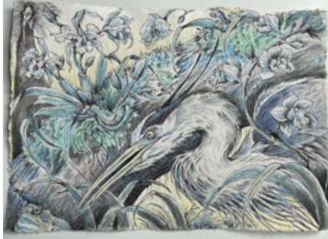
Cayetano Sanz de Santamaría The Hunt , 2024 Ink and watercolour on cotton paper 50 x 40 cm (framed) £1,250