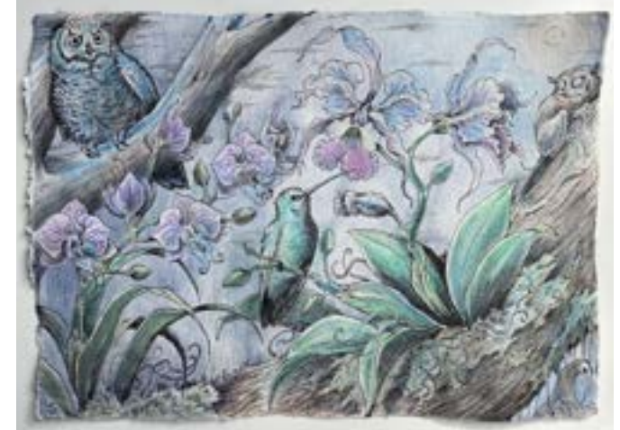
Cayetano Sanz de Santamaría Moonlight Sonata , 2024 Ink and watercolour on cotton paper 50 x 40 cm (framed) £1,250

These works are available for purchase Please contact @kate@artscopeintl.com regarding sales enquiries