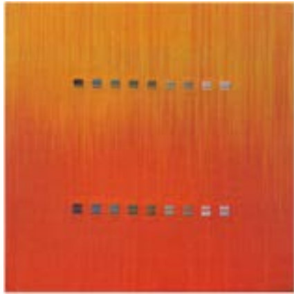
Ptolemy Mann The Golden Hour (Tangerine Light) , 2022 Hand dyed and woven viscose 44 cm x 44 cm (framed) POA