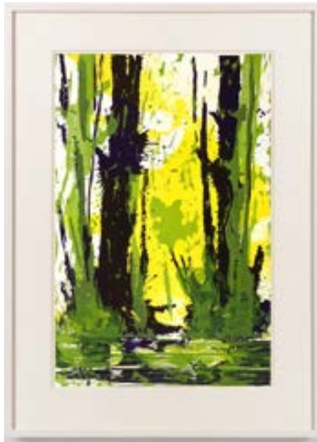
Bernd Zimmer Im Spiegel , 2018 Lithograph in colours on wove paper 56 cm x 36 cm £5,000