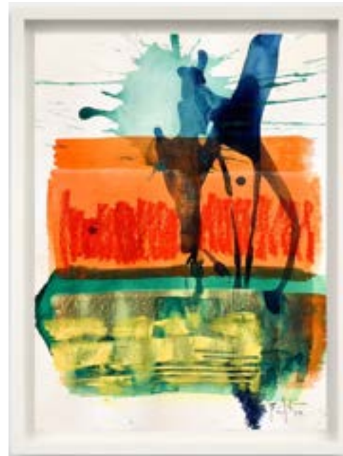
Bernd Zimmer Reflex , 2022 Acrylic on paper 42 cm x 30 cm £3,850

These works are available for purchase Please contact @kate@artscopeintl.com regarding sales enquiries