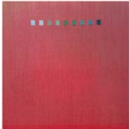
Ptolemy Mann The Golden Hour (Blue, Red Grid) , 2022 Hand dyed and woven viscose 44 cm x 44 cm (framed) POA