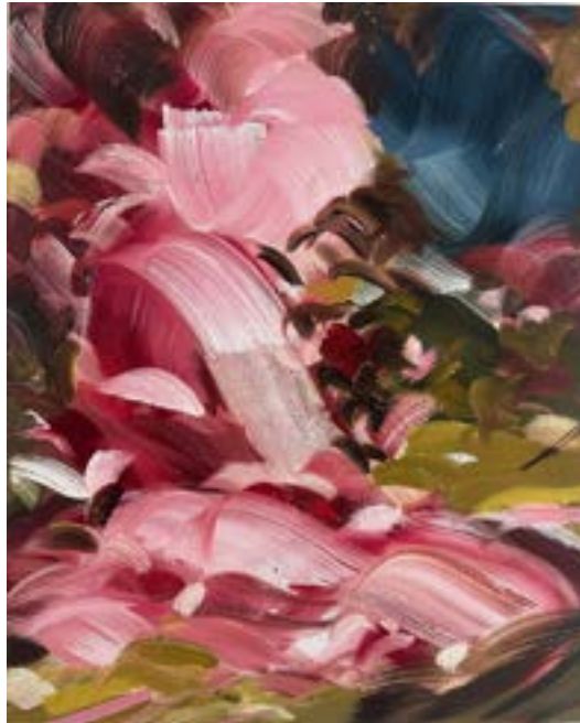
Meghan Baker Colour Study (Batten) , 2024 Oil on canvas £4,345