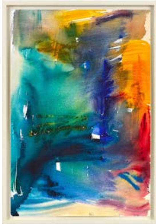
Francine Tint Dancing Soul, VII, 2022 Watercolour on paper 76.2 cm x 35.6 cm £5,000

This work is available for purchase Please contact @kate@artscopeintl.com regarding sales enquiries