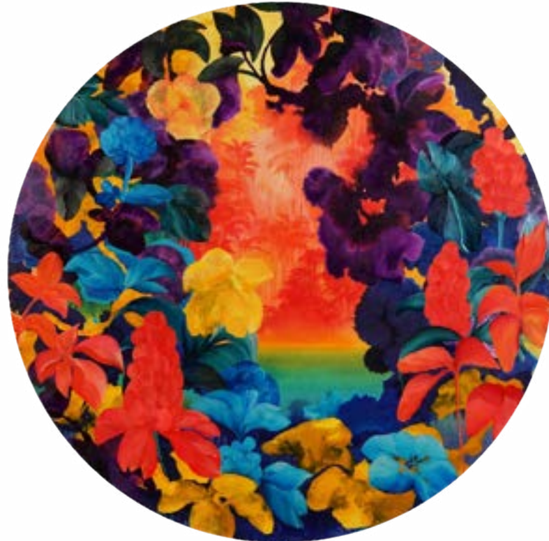
Orlanda Broom Torch Ginger , 2023 Acrylic on canvas 100 cm x 100 cm x 2 cm £8,000

These works are available for purchase Please contact @kate@artscopeintl.com regarding sales enquiries