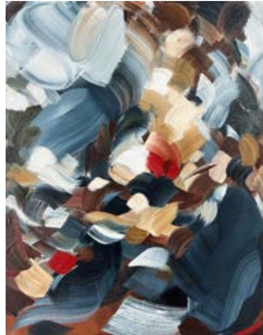
Meghan Baker Colour Study (Rosetti II) , 2024 Oil on canvas £4,345

These works are available for purchase Please contact @kate@artscopeintl.com regarding sales enquiries