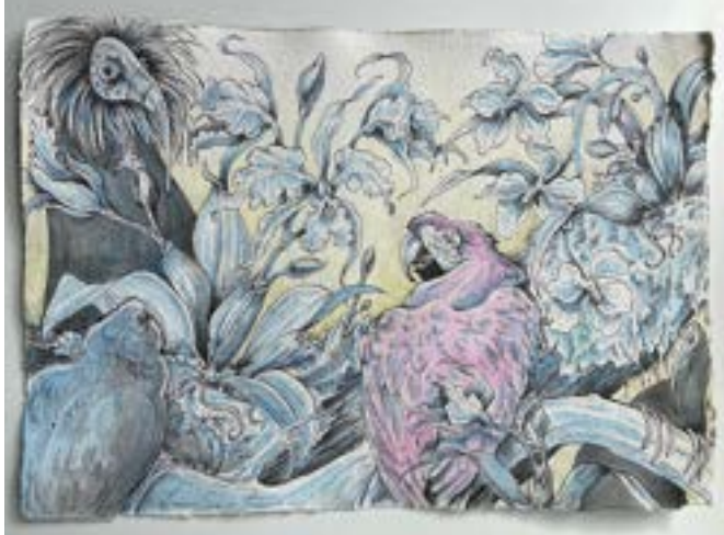
Cayetano Sanz de Santamaría The Answer Lies Right in Front of You , 2024 Ink and watercolour on cotton paper 50 x 40 cm (framed) £1,250