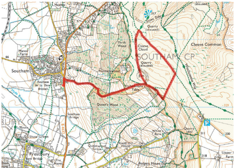
Map created by Lovell Johns Limited. Based upon Ordnance Survey digital map data © Crown Copyright 2019 Licence Number 43368U. All rights reserved.