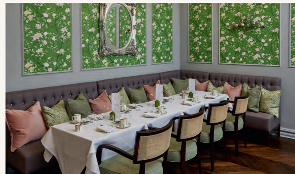
< Evergreen Tea Room

The Evergreen Tea Room is also available to hire for those most special of occasions such as baby showers, bridal showers, engagement parties and more.