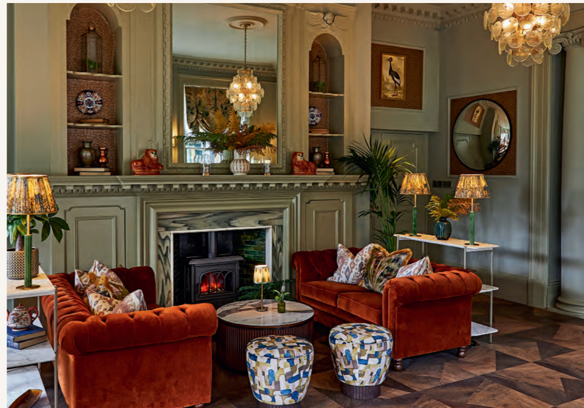
Verdure Lounge Bar

This magical space is also known to play host to an array of workshops and events, visit our website for more information.