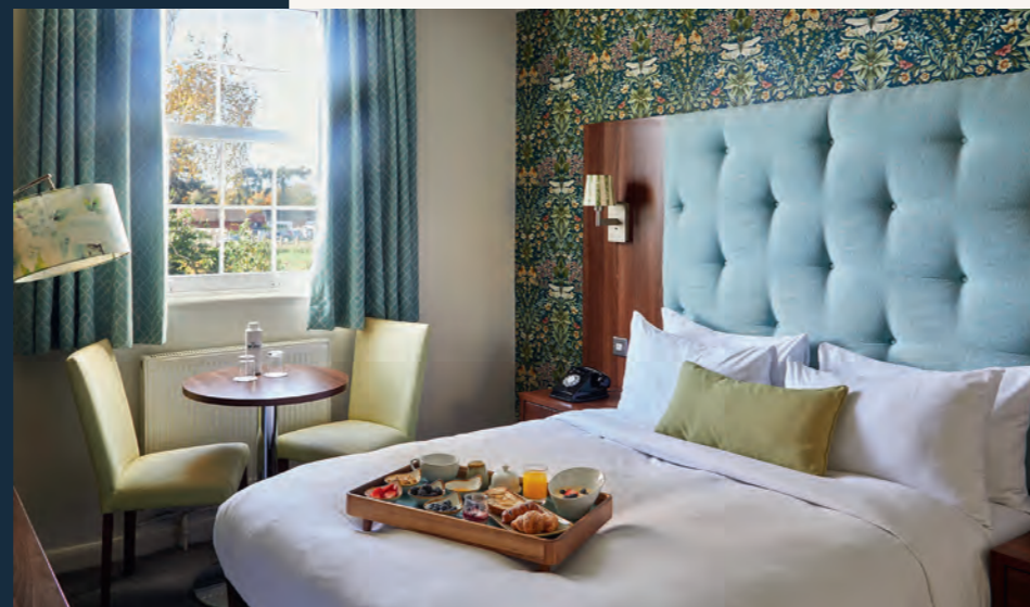
Nest Room >