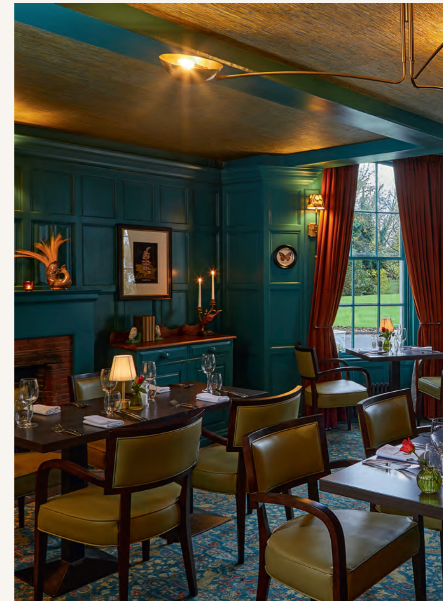
Brasserie 1727 & Arden

The dinner menu is inspired by dishes from around the globe whilst paying strict attention to the sourcing of our ingredients. Locally farmed, seasonal produce is responsibly sourced and expertly crafted to create an array of dishes that take you on a taste journey. Vegan and vegetarian guests are not forgotten either with a creative collection of plant-based plates.