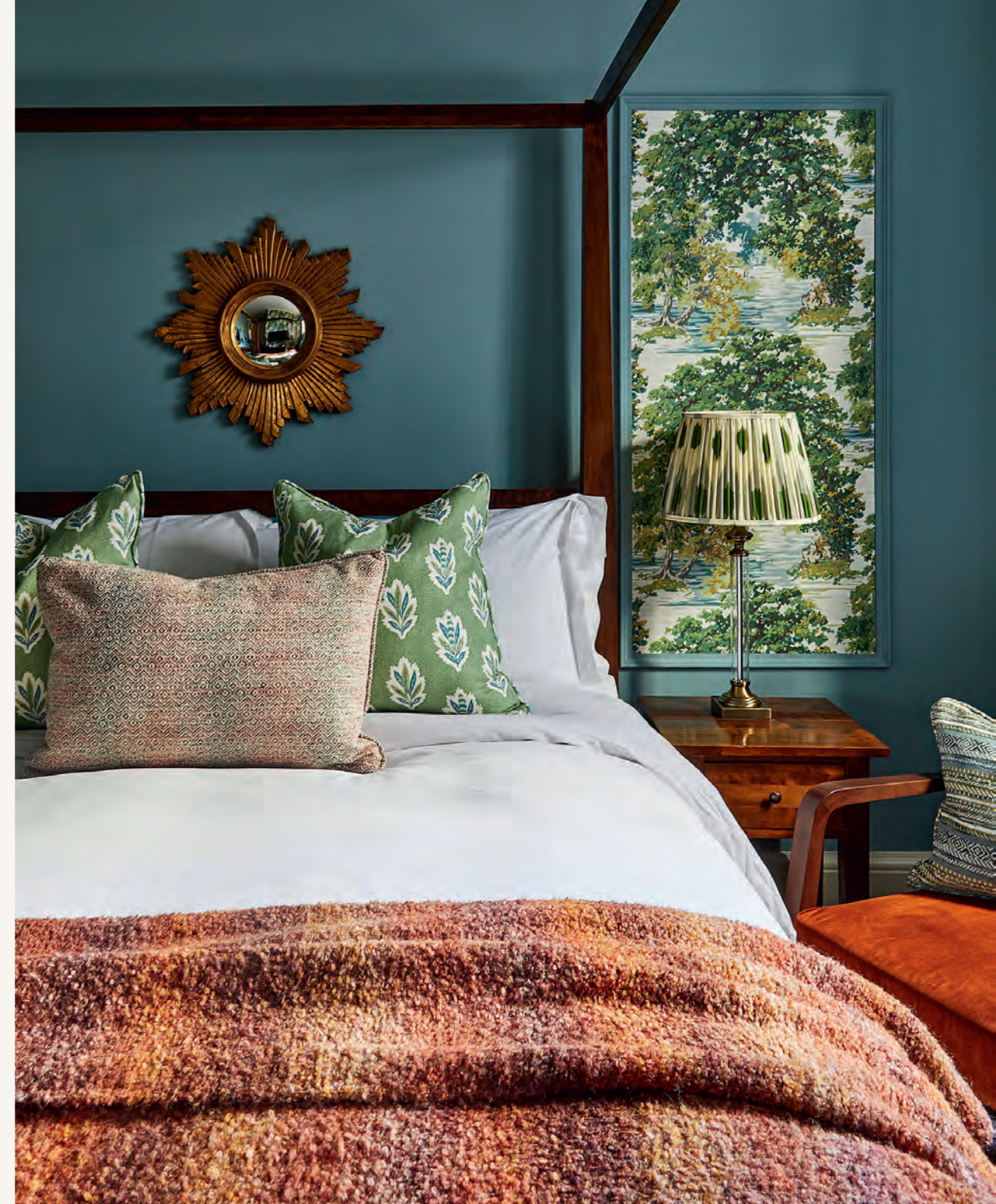
Oak Character >

Rest assured that all the little luxuries are provided from tea and coffee making facilities to hairdryers, TVs and more.