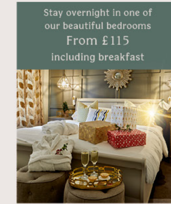
Stay overnight in one of our beautiful bedrooms From £115 including breakfast