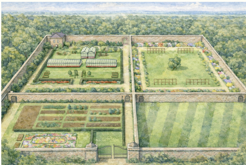
Bowood's Walled Garden

Bowood Afternoon Tea reflects the Estate as it stands today, respectful of its heritage, confident in its standards and assured in its progression. It is an experience shaped by care, precision and a genuine sense of hospitality, continuing a tradition that has long held a place at Bowood.