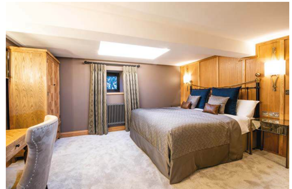
• Top; Lady Jane Suite | Bottom; Saltram Suite