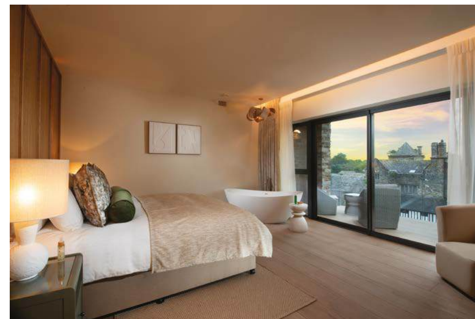
• Top; Wellness Suite Lounge | Bottom; Wellness Room