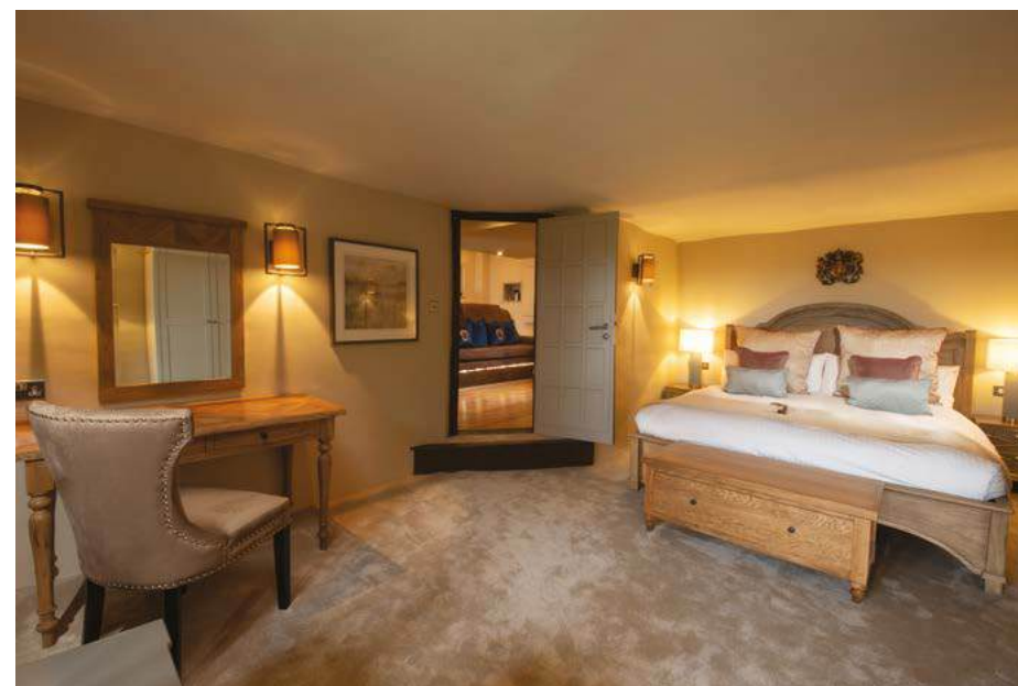
• Royal Suite