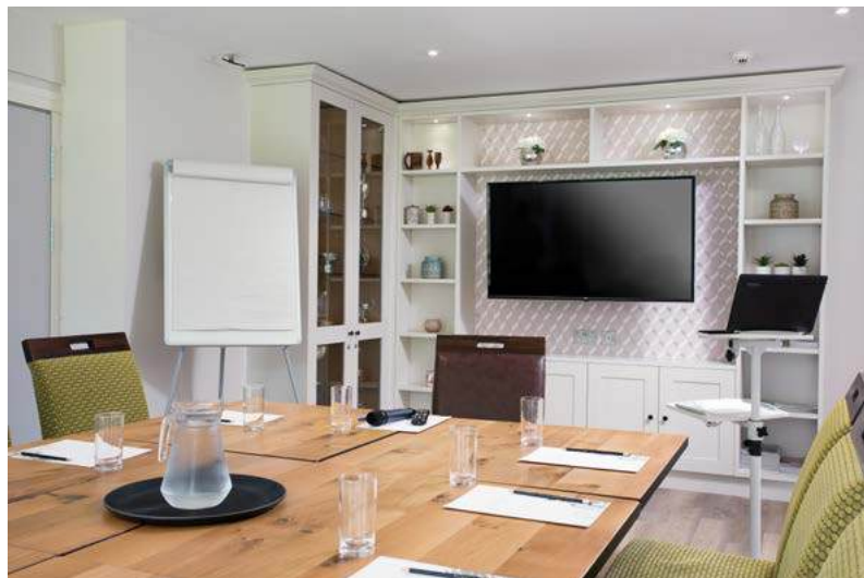
• Top; Fistral Beach Hotel - Conference Room | Bottom; Budock Vean Hotel - Conference Room