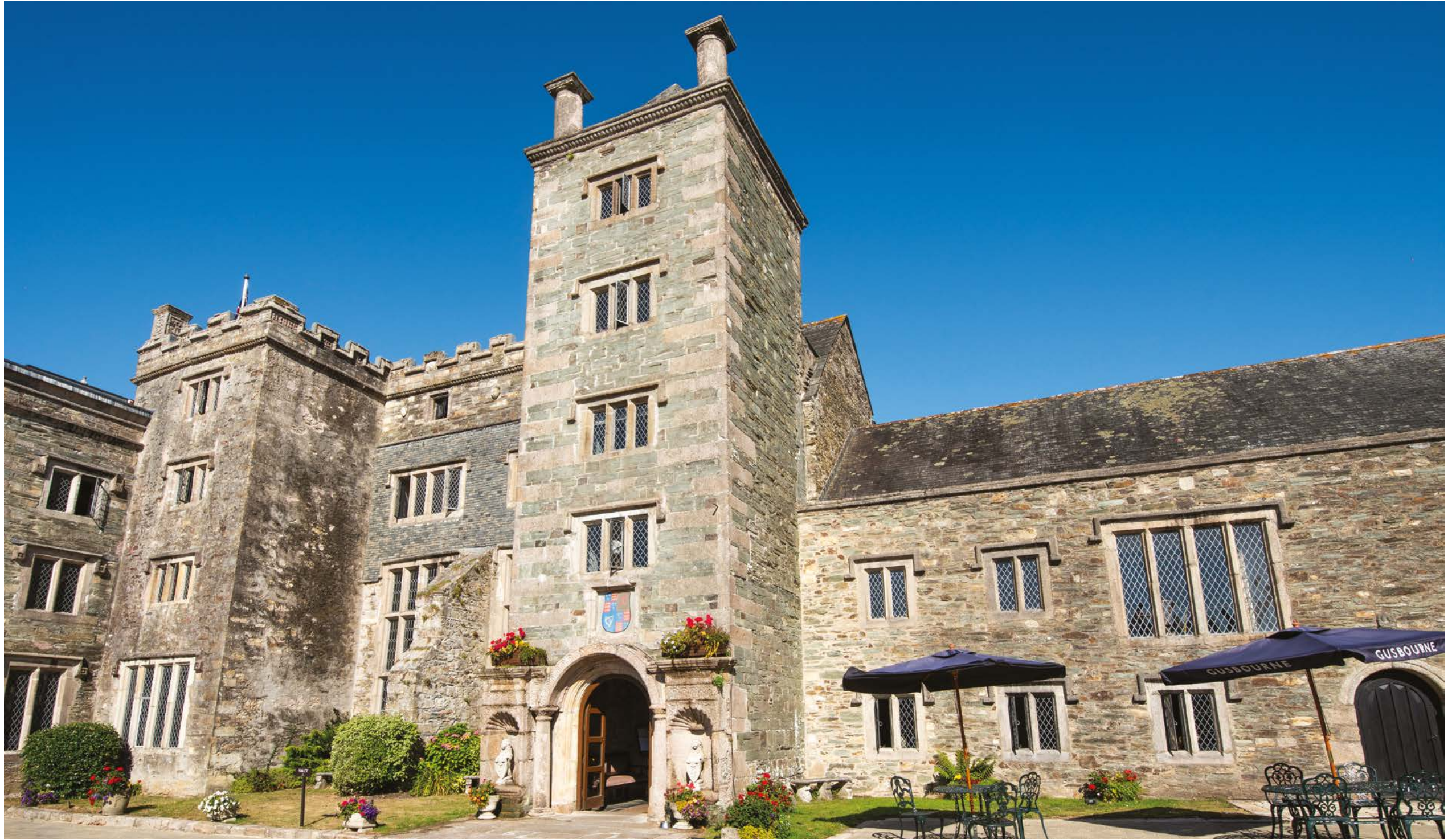
• Boringdon Hall