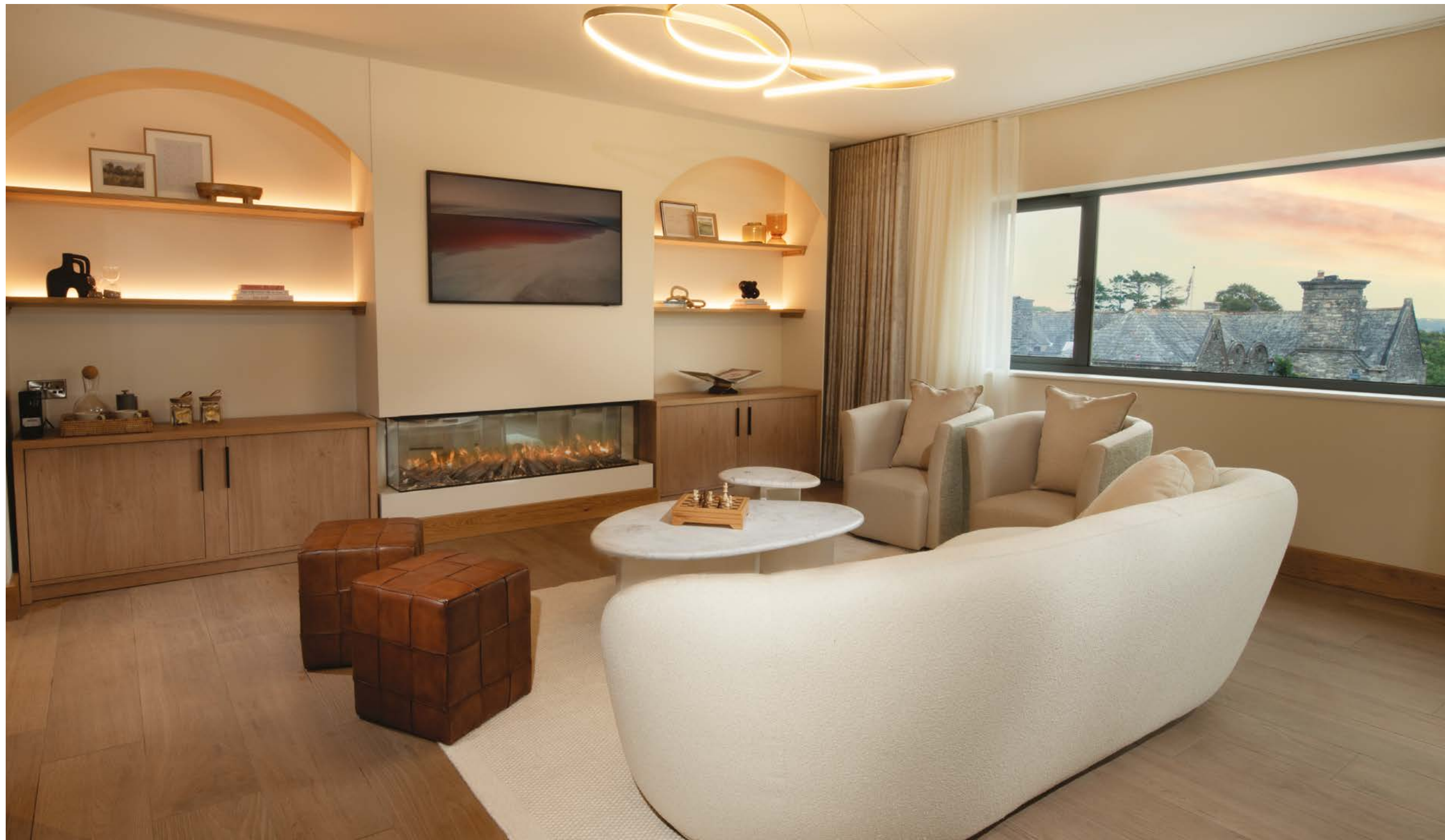
• The Saltram Suite