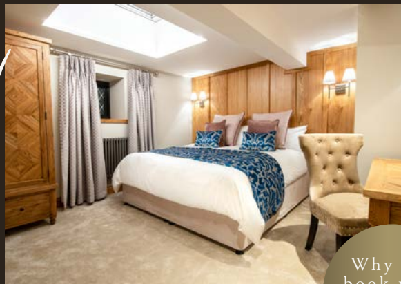
LADY JANE SUITE

Why not book your inclusive spa treatment?