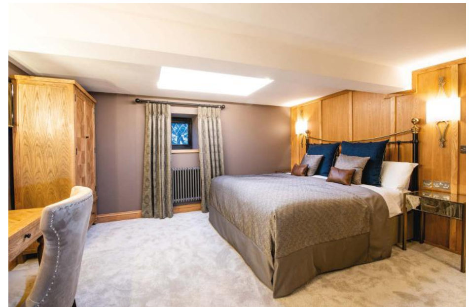
• Top; Lady Jane Suite | Bottom; Saltram Suite