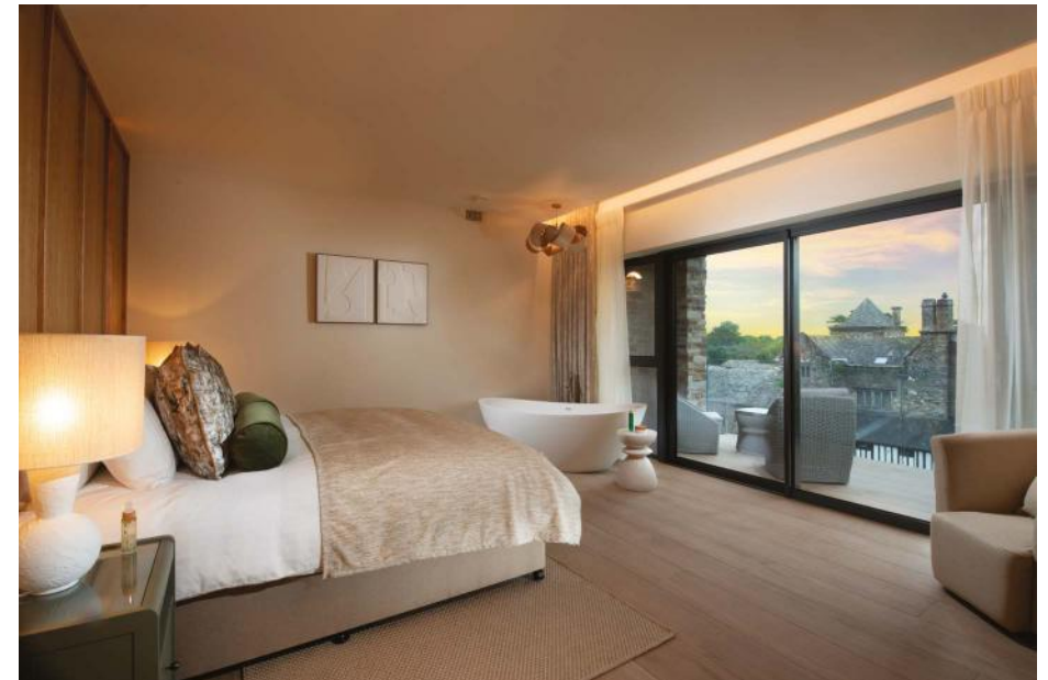
• Top; Wellness Suite Lounge | Bottom; Wellness Room