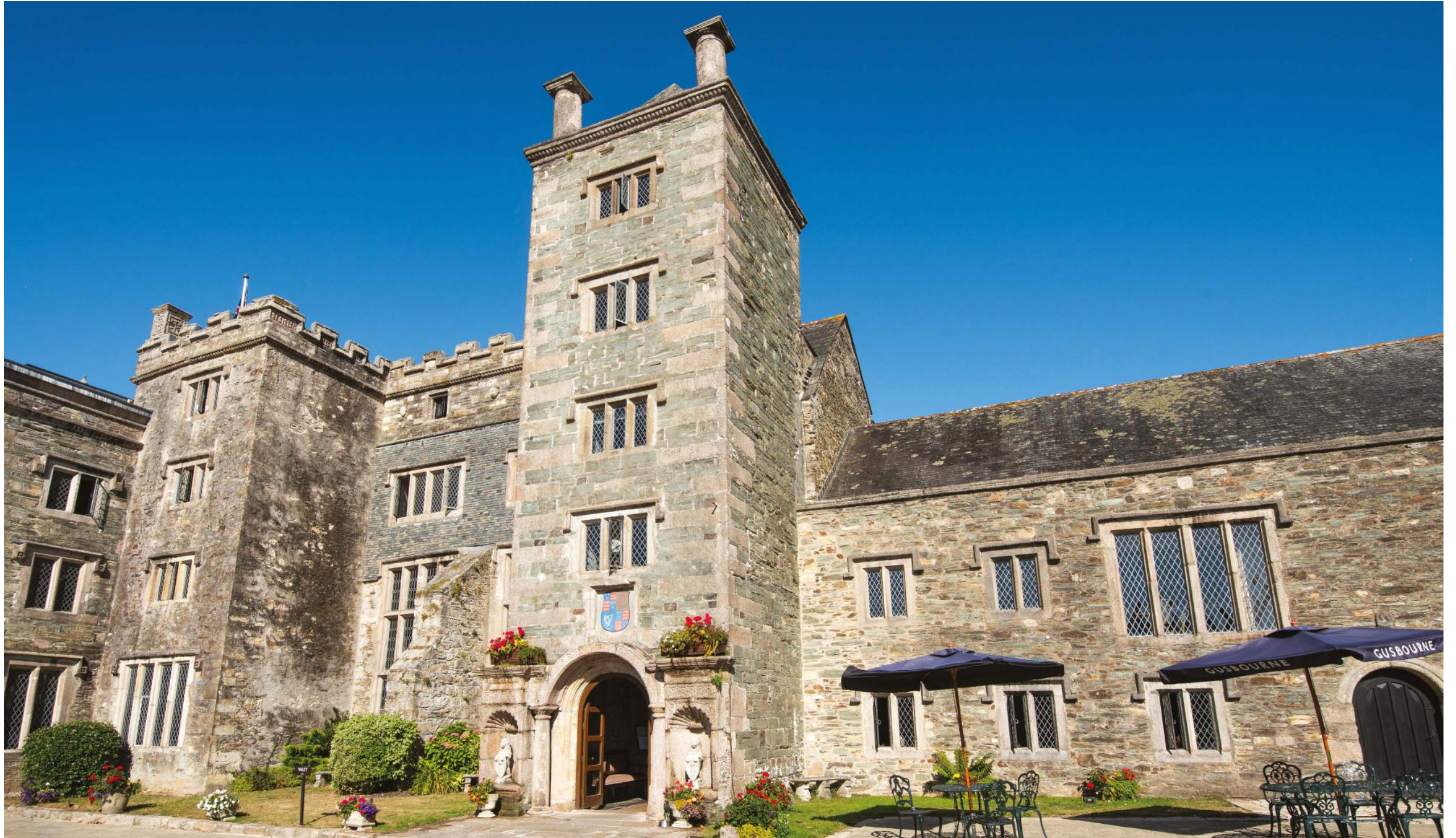
• Boringdon Hall