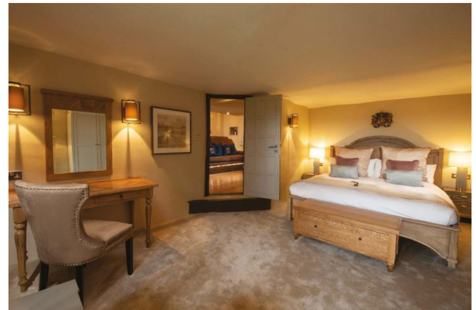
• Royal Suite