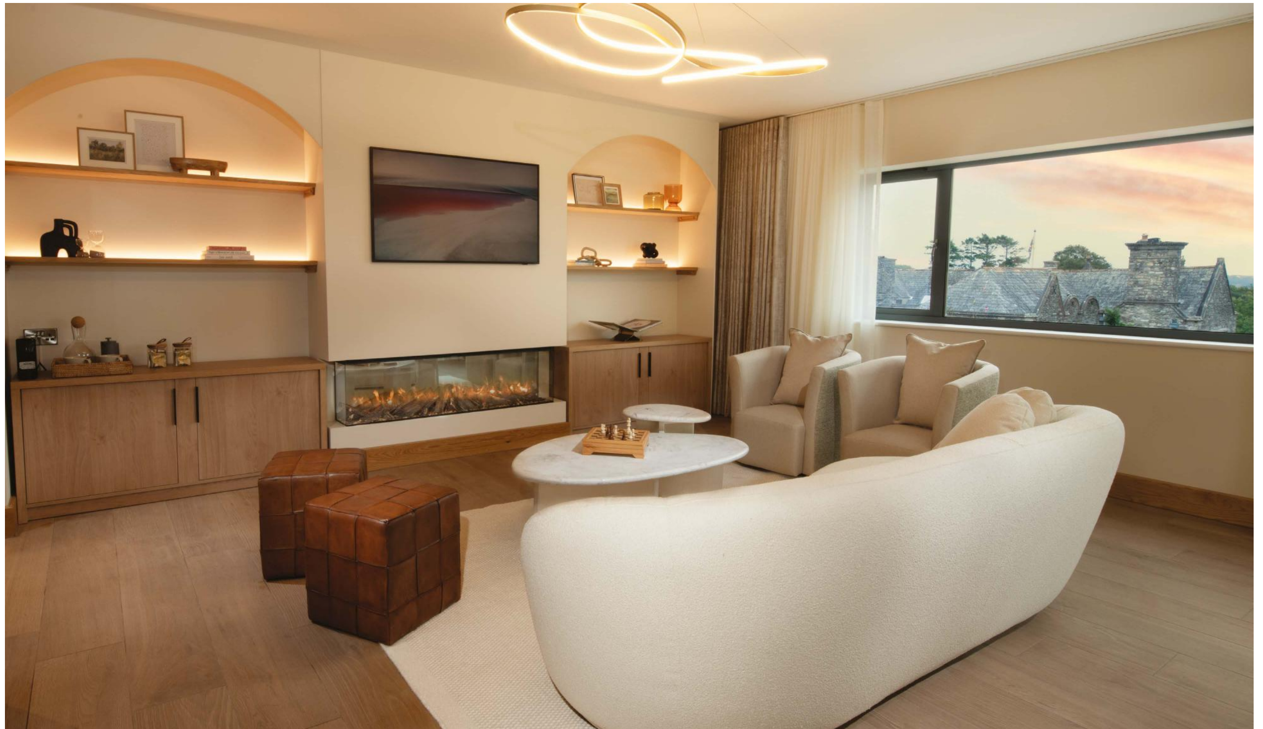
• The Saltram Suite