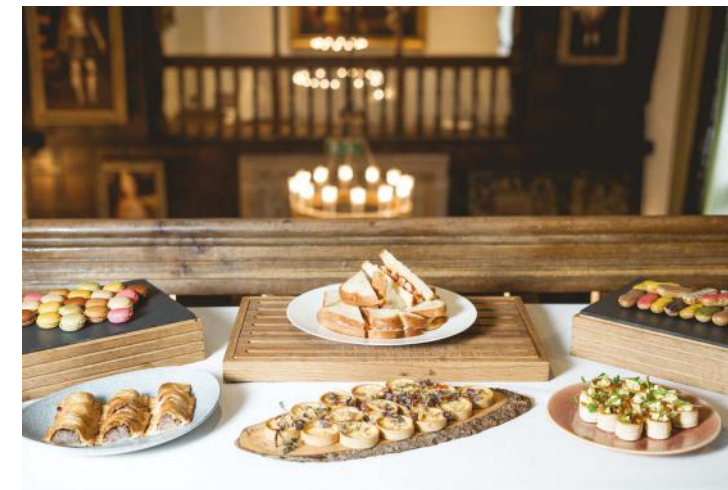
Top - Pastries & smoothies Bottom - Finger buffet