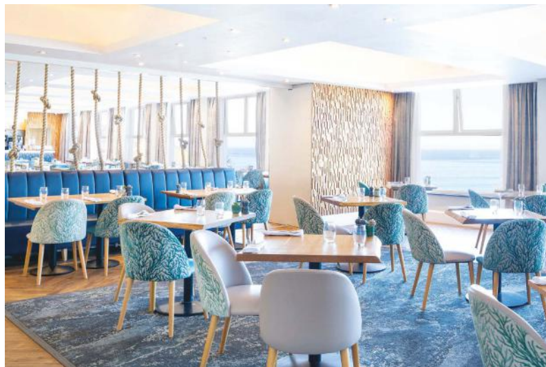
• Top; Fistral Beach Hotel - Conference Room | Bottom; Fistral beachside location