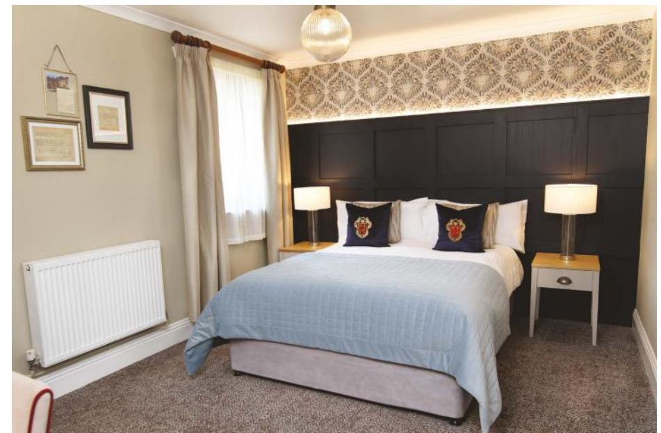
• Top; Courtyard Room | Bottom; Stable Room