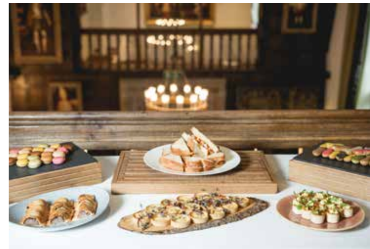
Left - Traditional afternoon tea Right Top - Cheese selection in Àclèaf Right Bottom - Finger buffet