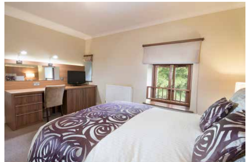
• Top; Courtyard Room | Bottom; Stable Room