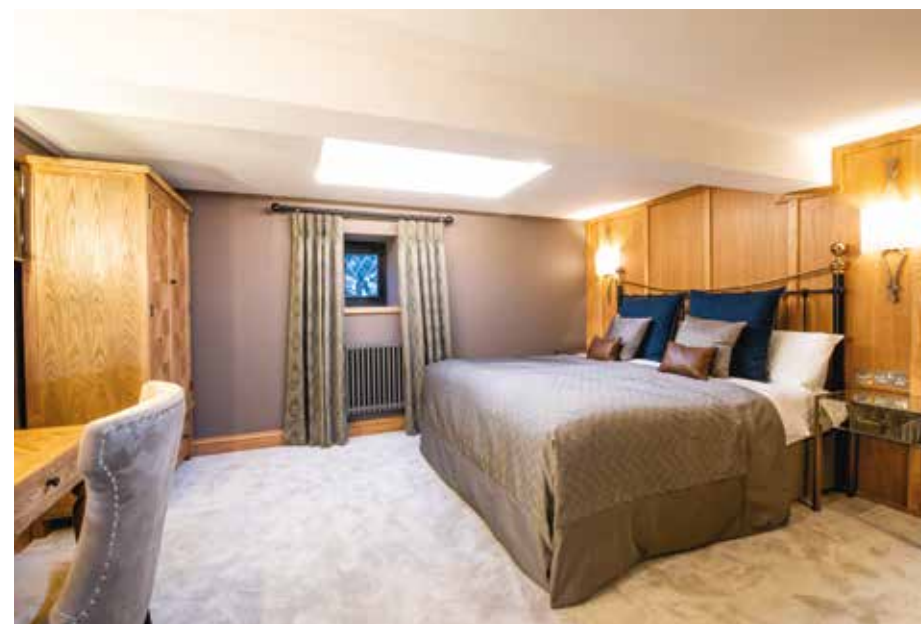
• Top; Lady Jane Suite | Bottom; Saltram Suite