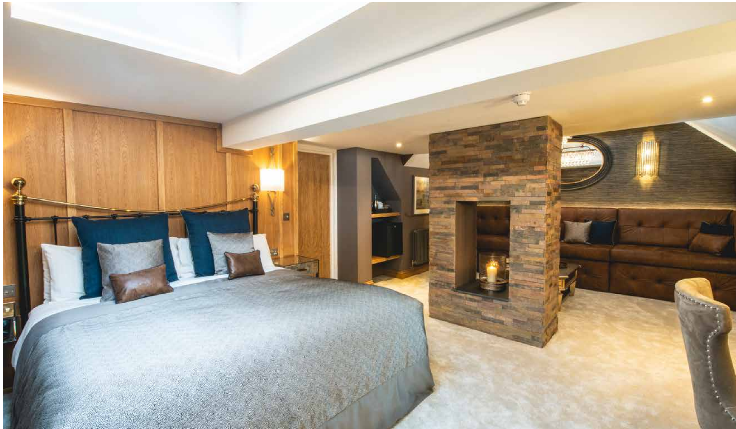
• The Saltram Suite