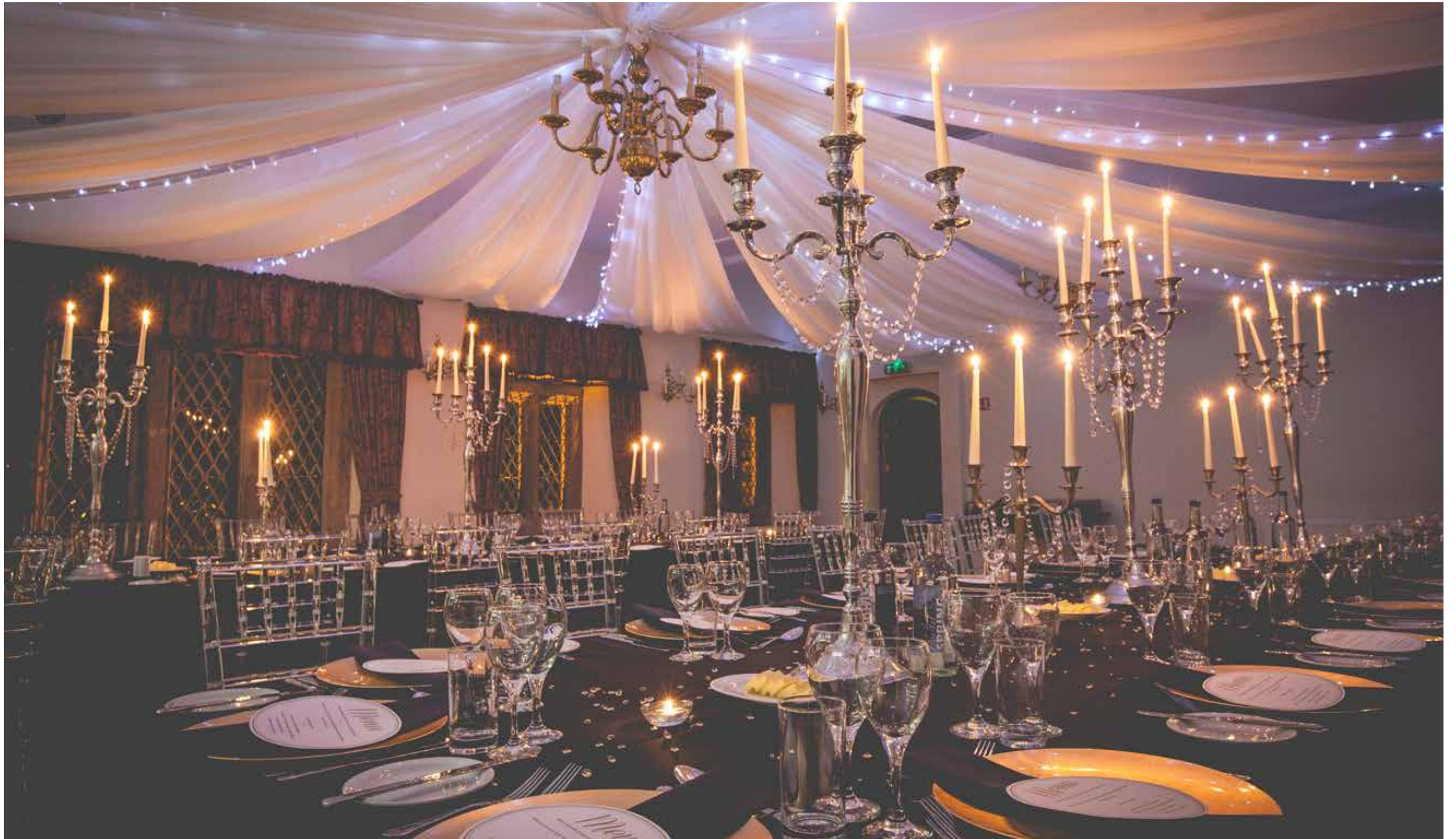
• Elizabethan Suite