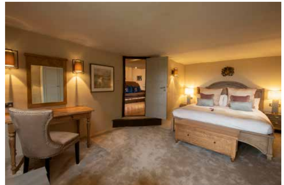
• Royal Suite