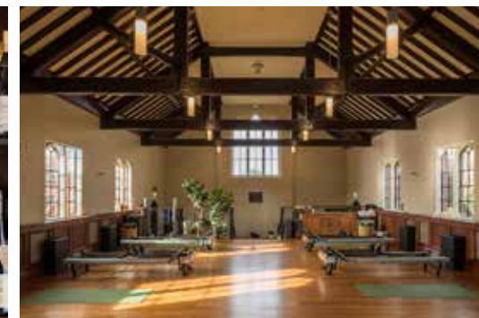
THE OAK HOUSE YOGA