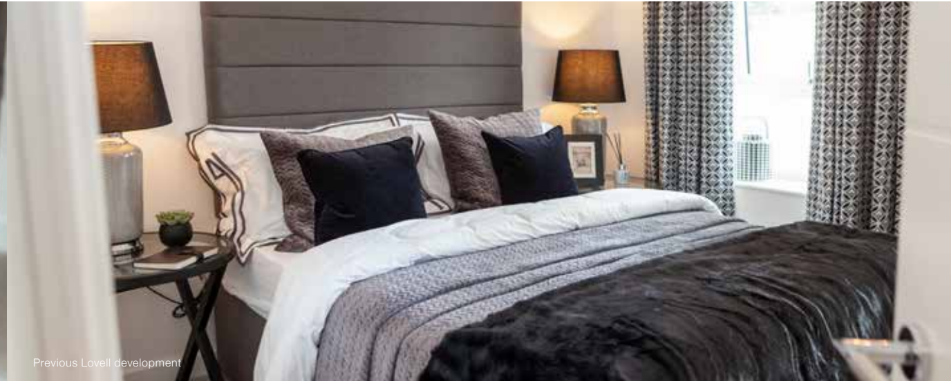
Previous Lovell development