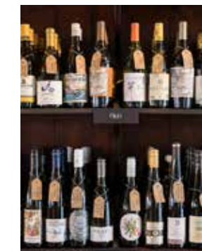
CELLAR DOOR WINES

The grounds of this elegant country house provide a beautiful outdoor escape to enjoy on sunny days. It also plays host to exciting events such as festivals, live music, theatre productions, cinema evenings and the annual fireworks display – as well as being home to The Stable Yard with its shops and studios. A truly unique experience.