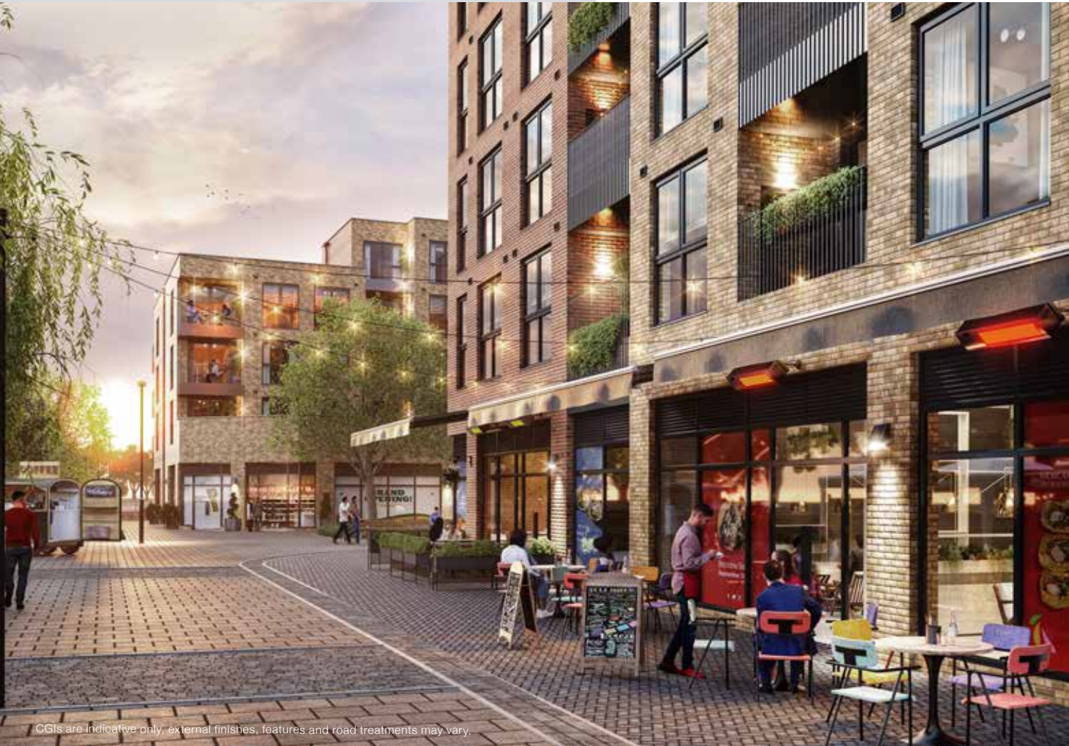
CGIs are indicative only, external finishes, features and road treatments may vary.

Convenience and choice are at the heart of Vista living. From popping out for your morning coffee, spending lazy Sundays brunching in The Stable Yard, making the most of the beautiful Hertfordshire countryside or jumping on the train back to bustling London (via a short stroll to Hatfield Station), everything is at your fingertips. You choose where you want to be, when you want!