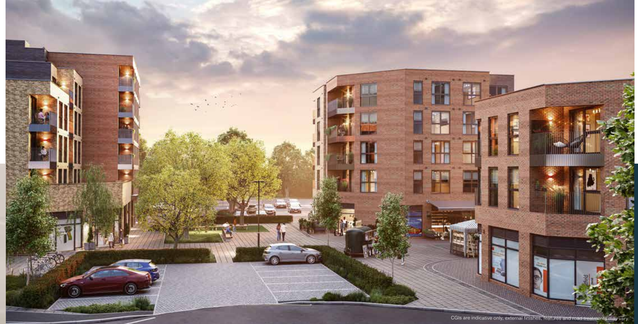
CGIs are indicative only, external finishes, features and road treatments may vary.

Every one of the homes we build is built with one crucial extra element: pride. Lovell only builds high-quality homes and we make customer satisfaction our number one priority. This means that you enjoy extraordinary value for money, as well as a superior and distinctive home.