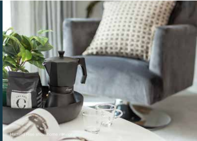
Hatfield Rise show home interior