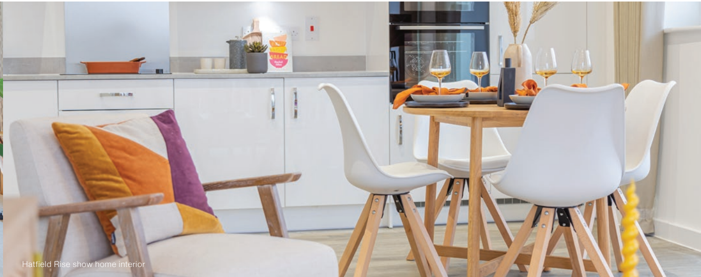
Hatfield Rise show home interior

Every one of the homes we build is built with one crucial extra element: pride. Lovell only builds high-quality homes and we make customer satisfaction our number one priority. This means that you enjoy extraordinary value for money, as well as a superior and distinctive home.