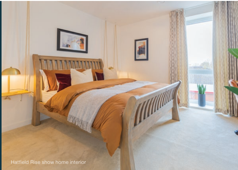
Hatfield Rise show home interior