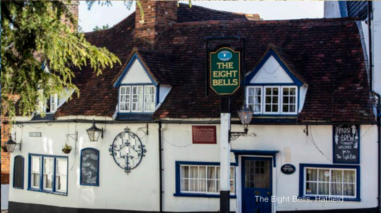
The Eight Bells, Hatfield