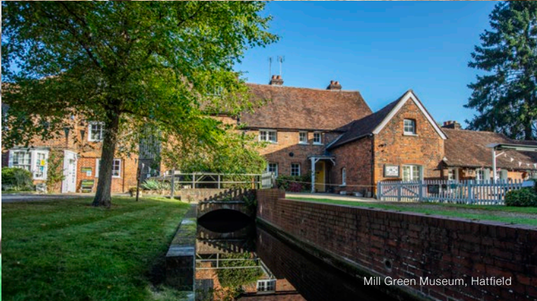
Mill Green Museum, Hatfield