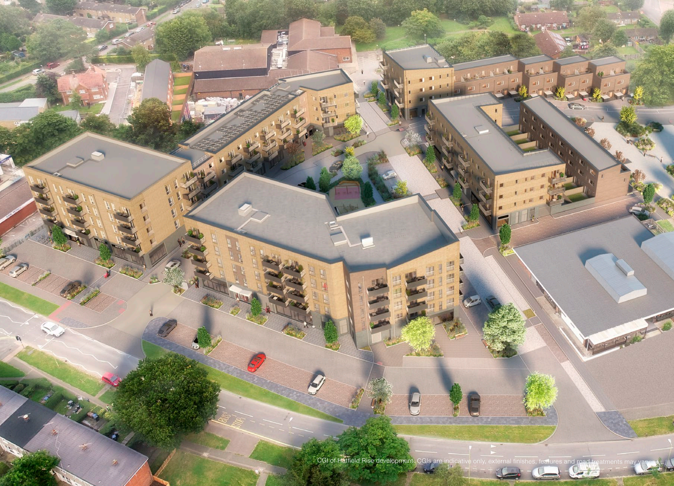
CGI of Hatfield Rise development. CGIs are indicative only, external finishes, features and road treatments may vary.