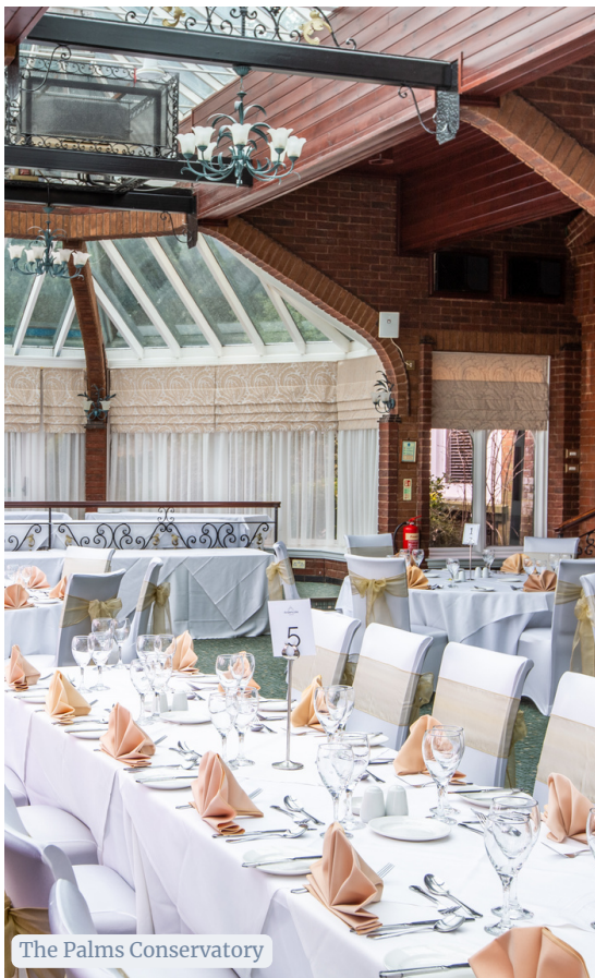
The Palms Conservatory